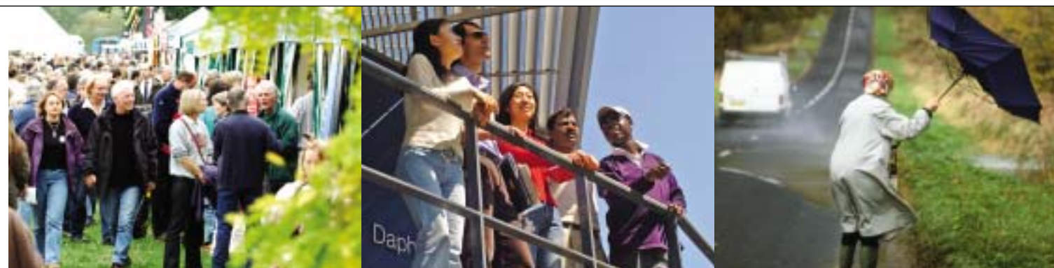
Cllr Keith Mitchell Chairman of the Assembly

The next stage is for the Plan to be assessed by an expert panel at an Examination in Public that is due to begin in November 2006. Before that there is a final opportunity for stakeholders, local authorities, other organisations and members of the public to comment on this final draft as agreed by the Regional Assembly. In the meantime we will be preparing our case for the Examination in Public, marshalling not only the substantial technical research and analysis underpinning the Plan, but also the extensive public opinion evidence that has informed this final draft. The stronger the case we present, the more difficult it will be for these policies and priorities – our own views about our own future – to be overridden by central Government.